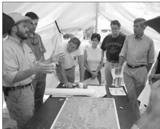
Board members (current and emeritus) met to consider a draft of plans for Base Camp improvements at the end of last summer.

The photography program has long been a treasured feature of the expeditions, documenting every expedition back to 1926. Today, our photographic archives are one of our prized possessions and photography is integrated into many of the other disciplines at base camp as well. As we have embraced digital photography, it has become an even more effective means of documenting our work in ecology, archaeology and native arts. At the end of each summer, the Trekkers and staff in each group collect literally thousands