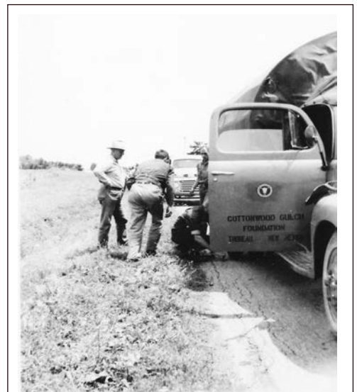
Mechanical problems- some things never change!